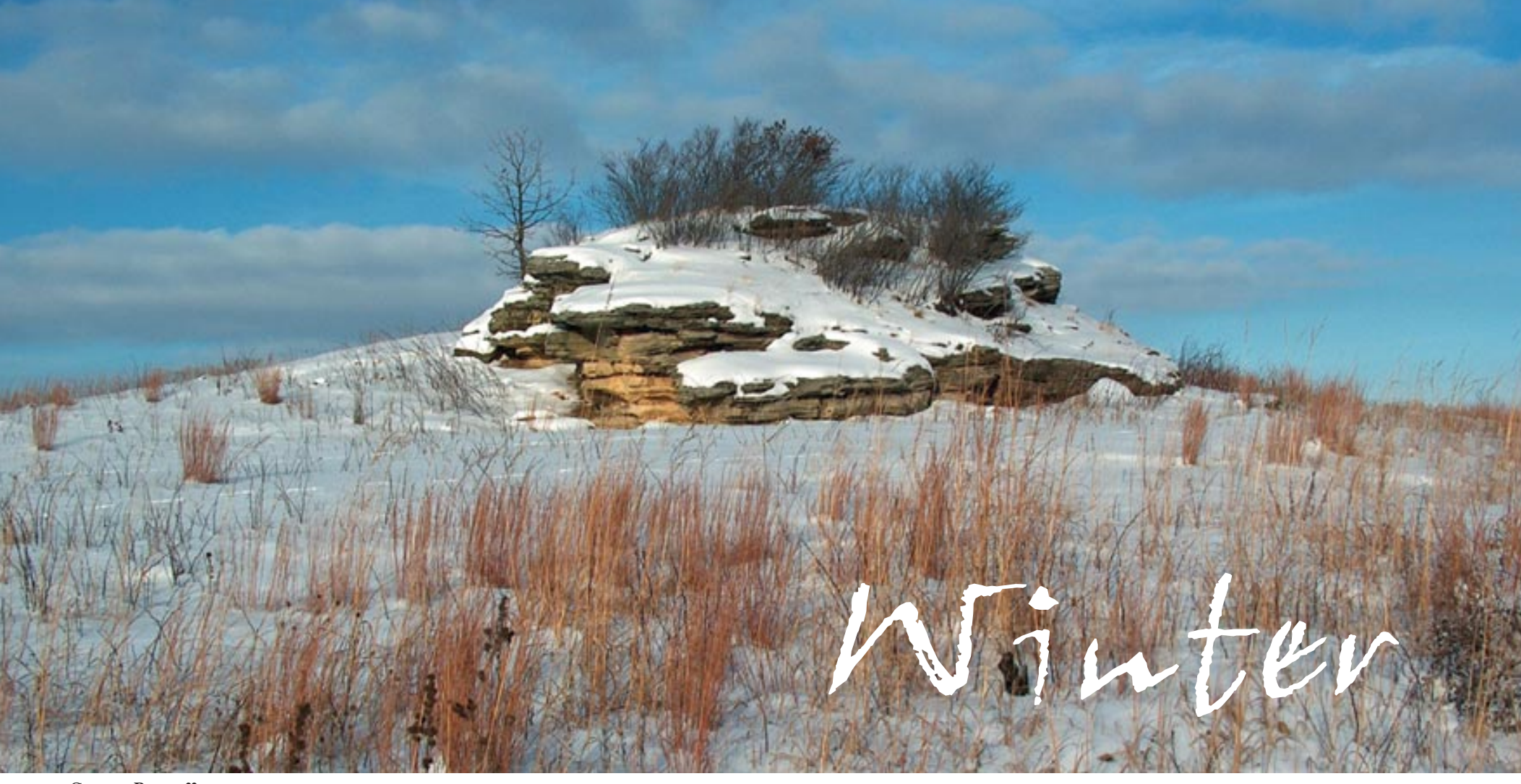
COYOTE POINT ♥