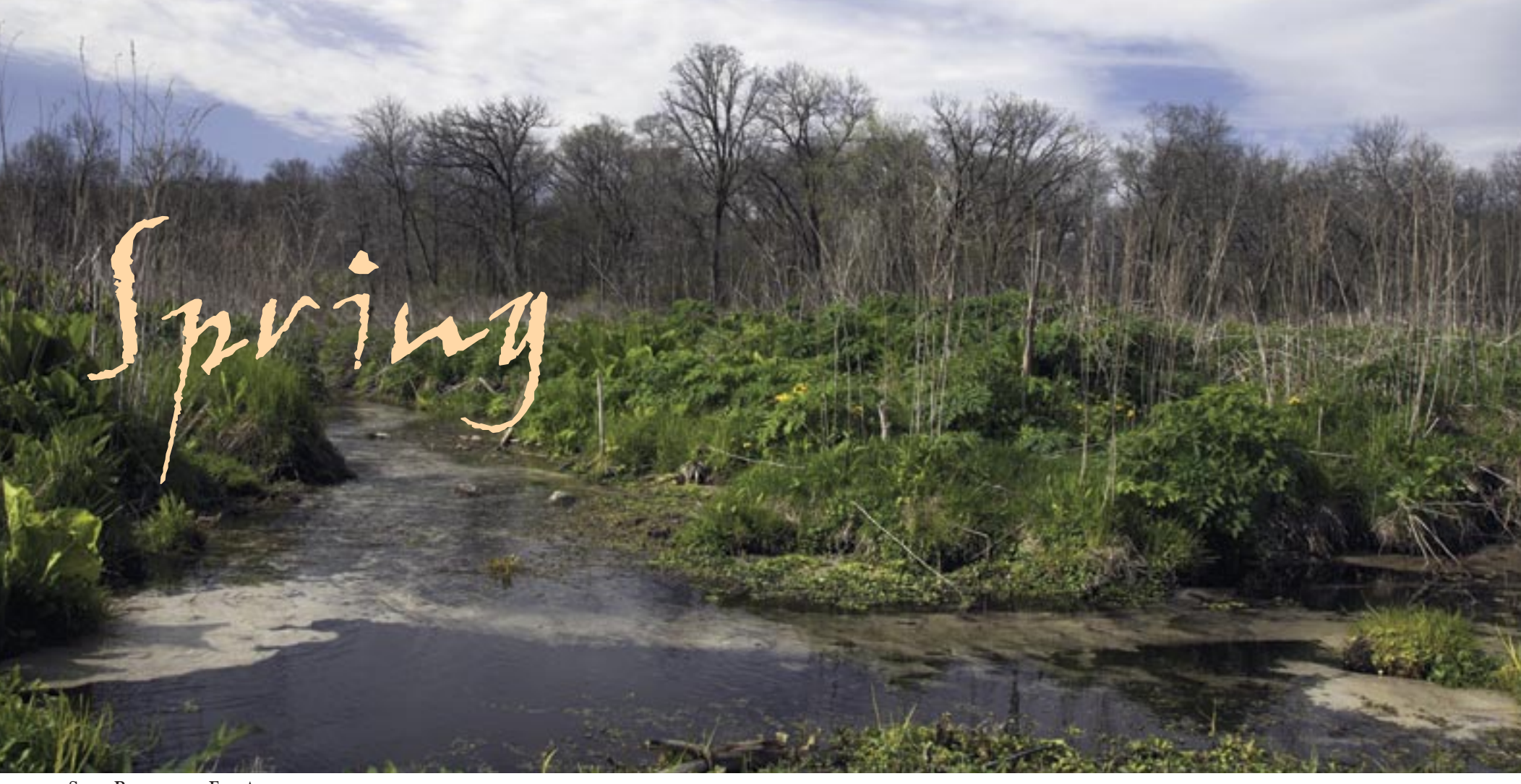
SAND BOIL IN THE FEN \star