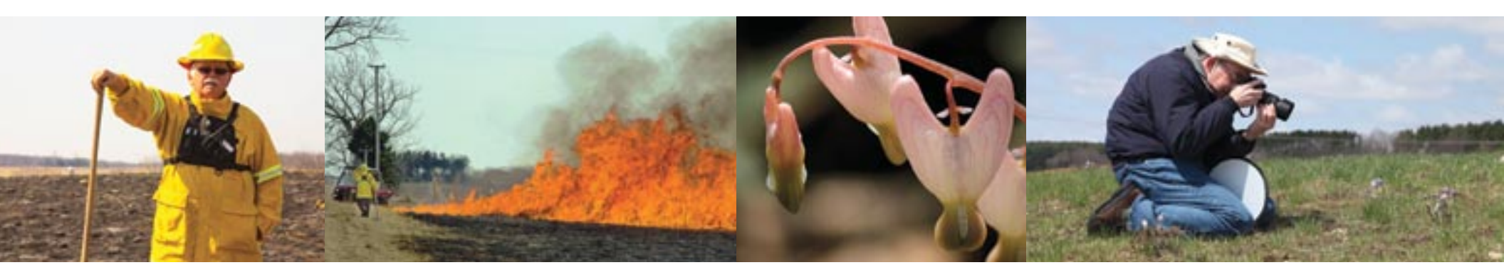
Paul Soderholm at Prescribed \, Prescribed Fire \star Burn Debriefing \star