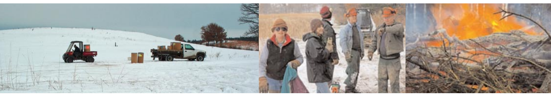
Planting in the Snow ♥ Winter Workday Break Time ★ Brush Pile Fire ★