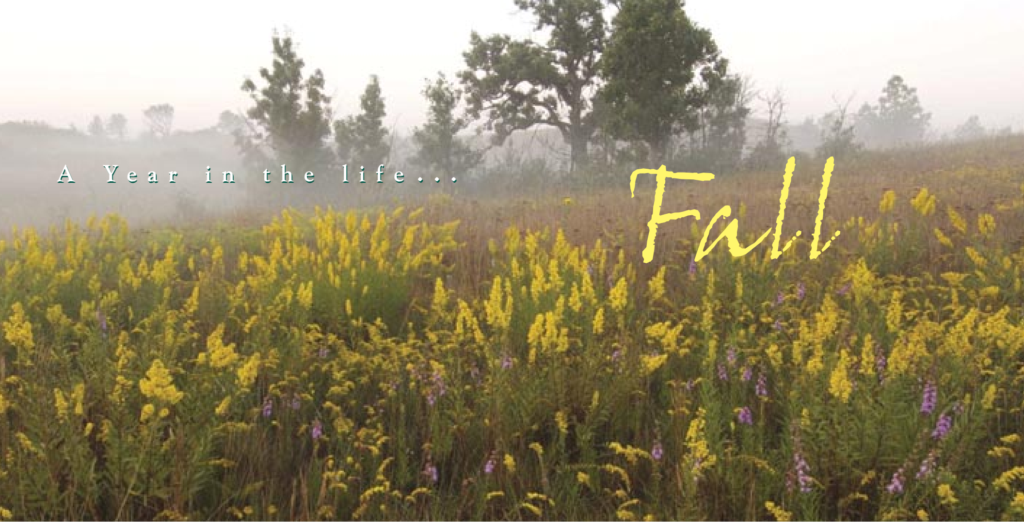
FOG BEFORE SUNRISE •