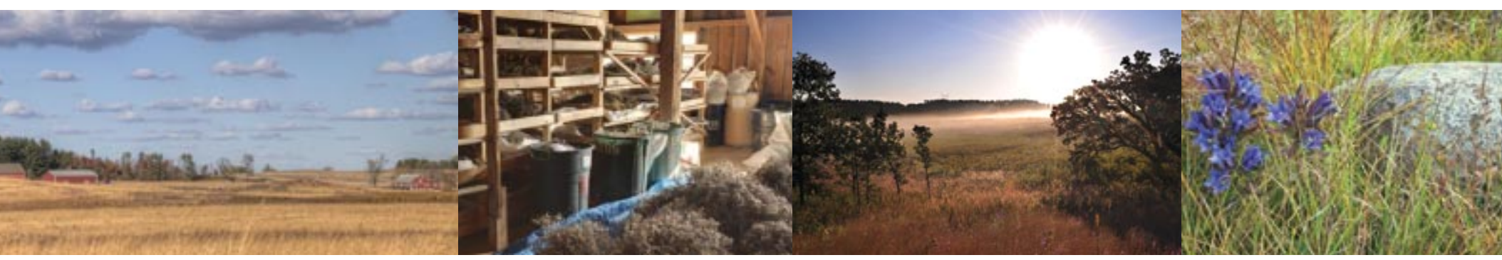
Browning grass dominates the Main Unit \star