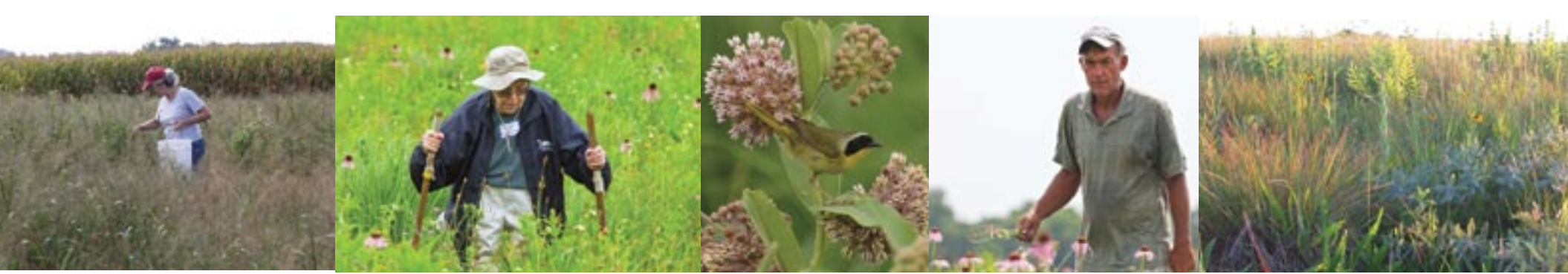
CINDY BUCHHOLZ IN THE Prairie Dropseed Garden ★