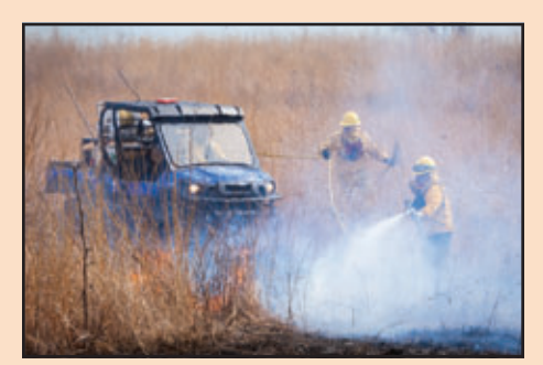
2017 Modern UTV and sprayers