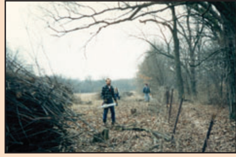
1996 Clearing a fire break by hand