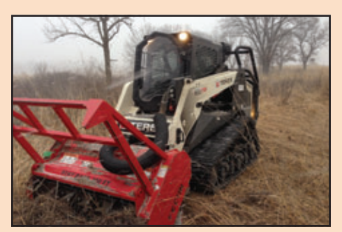
2017 Forestry machine creates fire breaks with ease