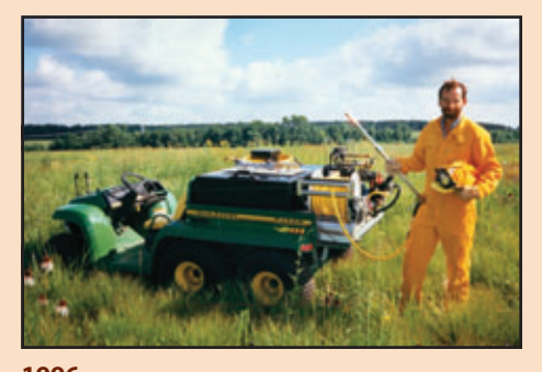
First pumper unit and Nomex fire suit