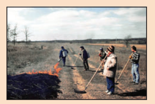
1992 Nachusa Fire Crew Primative tools and no safety equipment