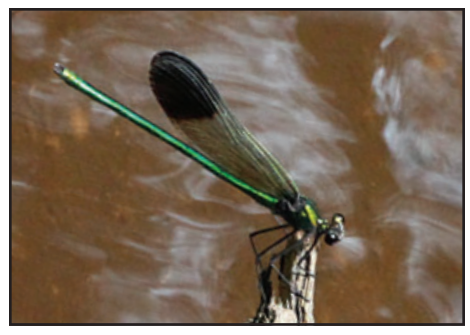
"RIVER JEWELWING"