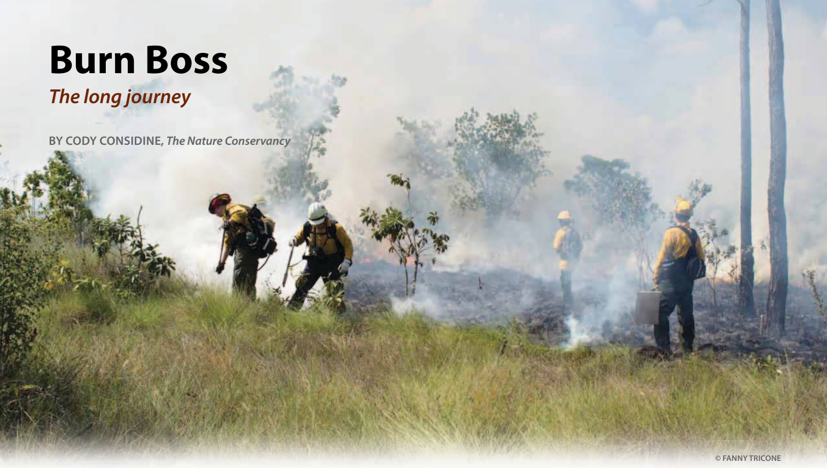
On the right side I'm pictured overseeing a suppression exercise in Belize, a coastal country in Central America. Training in Belize in February of 2019 was an incredible experience! Learning about the culture and ecology and developing new friendships with Belizeans and my fellow colleagues from across the Conservancy was the highlight of my fire training journey.

Tremember it well, my first day as the restoration ecologist at Nachusa in May of 2008. Although I greatly appreciated my time in graduate school at Southern Illinois University, Carbondale, I was thrilled to be working full time at such an amazing place, finally out of the classroom. How naive I was in thinking I was completely out of the classroom.