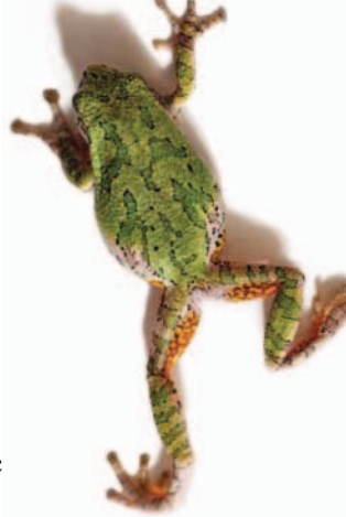
Cope's gray treefrog (Hyla chrysoscelis)

Citizen science is a great way to experience Nachusa, learn more natural history, and contribute to better understanding of our restoration work. All teams welcome and train new